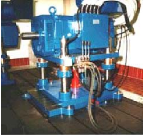
X-Y-Z positioner unit with 4-pillar guide for the mounting of a braking unit

We design and manufacture load rated X-Y-Z Tables for mainly the Automotive Testing Industry. We design and build tables from small to large to cover the whole range of driveline applications. Please e-mail us for a free price quote or call 952 942-6104.